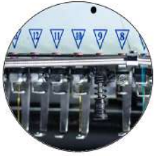
INBUILT BORING DEVICE