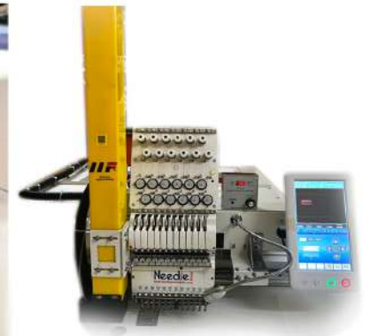
LASER CUTTING DEVICE