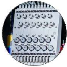
THREAD BREAK DETECTION