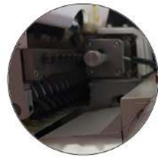
AUTOMATIC COLOR CHANGE