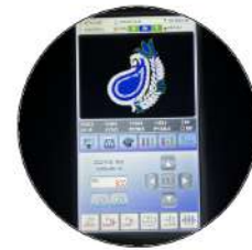
8" OR 10" USER FRIENDLY TOUCH PANEL